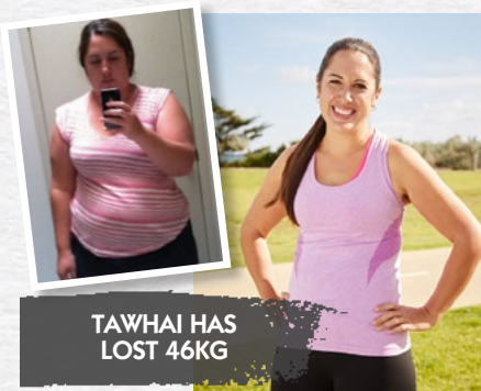
TAWHAI HAS LOST 46KG

Mums lose an average of 4-6kg* every month on our achievable plans